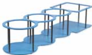
Bottle stand 1 x 4 configuration Wellwash Versa