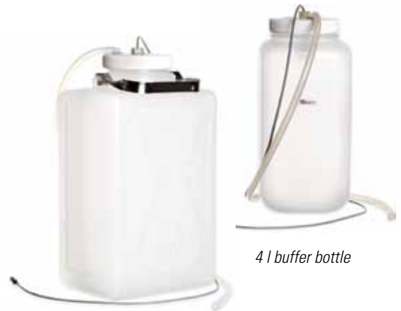
9 l waste bottle