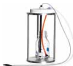
Bottle stand for user bottles