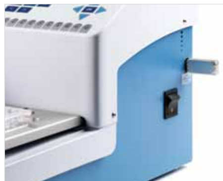
Wellwash Versa with a USB flash memory stick