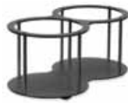
Bottle stand 1 x 2 configuration Wellwash