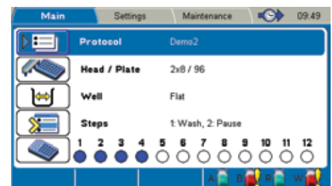
Wellwash Versa user interface - main view