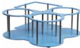
Bottle stand 2 x 2 configuration Wellwash Versa